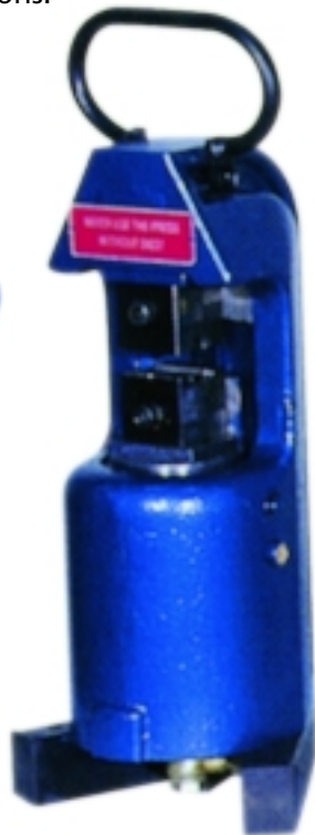
18 tonne Talurit press. Dies for British Standard, DIN Standard and Hexlock available.