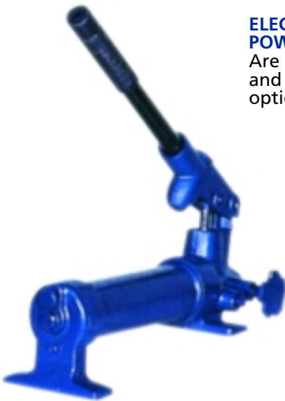
Hand operated pump.

Are available with single phase and three phase electric options.